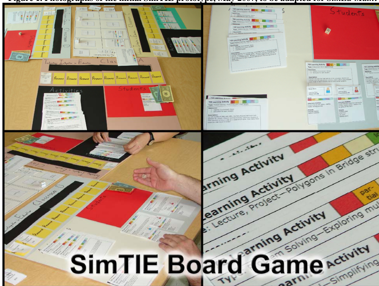
Figure 1. Photographs of the initial SimTIE prototype, May 2007, to be adapted for SimEd-Math .

called the Diffusion Simulation Game (DSG) (Frick, Kim, Ludwig & Huang, 2003). The DSG has been played by over 3,000 students at Indiana University during the past 5 years, and a limited version available to the general public has been played more than 4,000 times in the past 17 months. The principal investigator has also led the design of online learning about plagiarism that has received over 4 million page views in the last 3 years, with over 125,000 students passing the plagiarism test in 2007. We have reason to believe that well-designed and effective Web-based e-learning has great power and reach. We expect SimEd-Math to reach a very wide audience of both preservice teachers (our primary target audience) as well as teachers on the job.